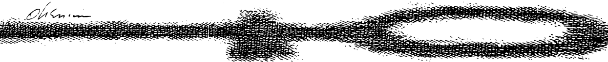
For The Inquirer / NANCY OHANIAN

Those who want to force women to use it and those who fear it is a racist plot — are out of touch with the realities.